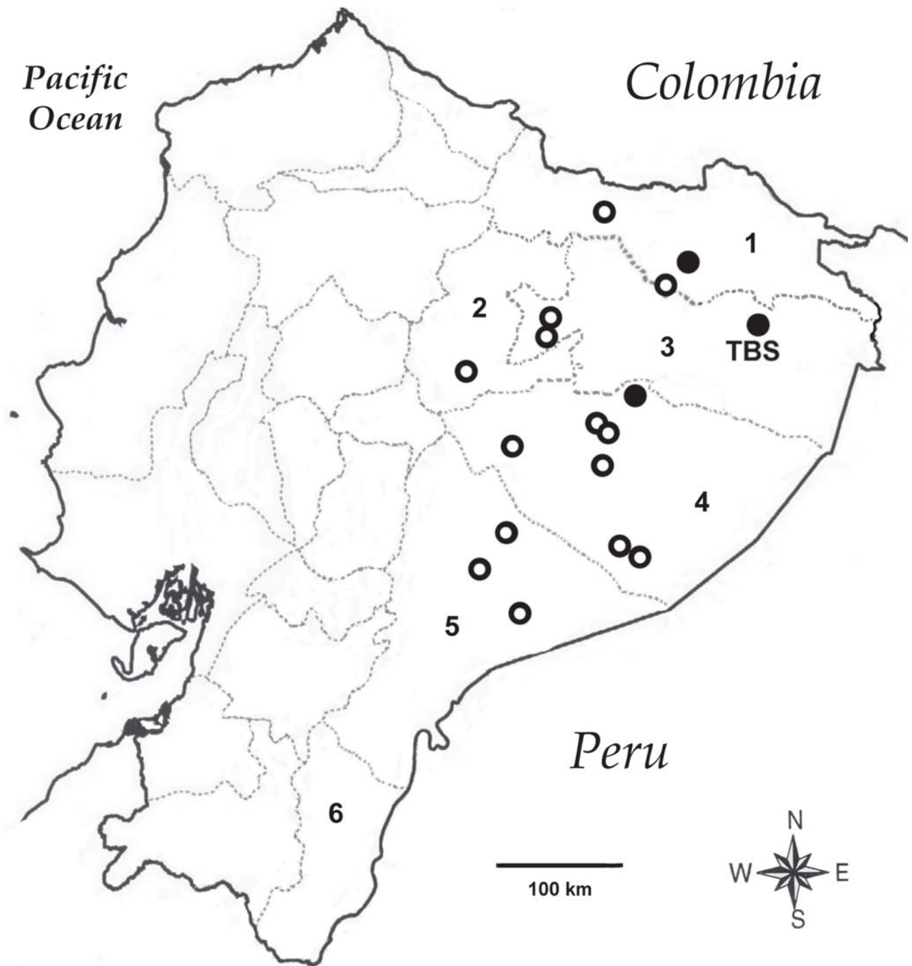
Figure 5. Known records of Platemys platycephala (circles) in the Republic of Ecuador. For symbols equivalence see Figure 1.