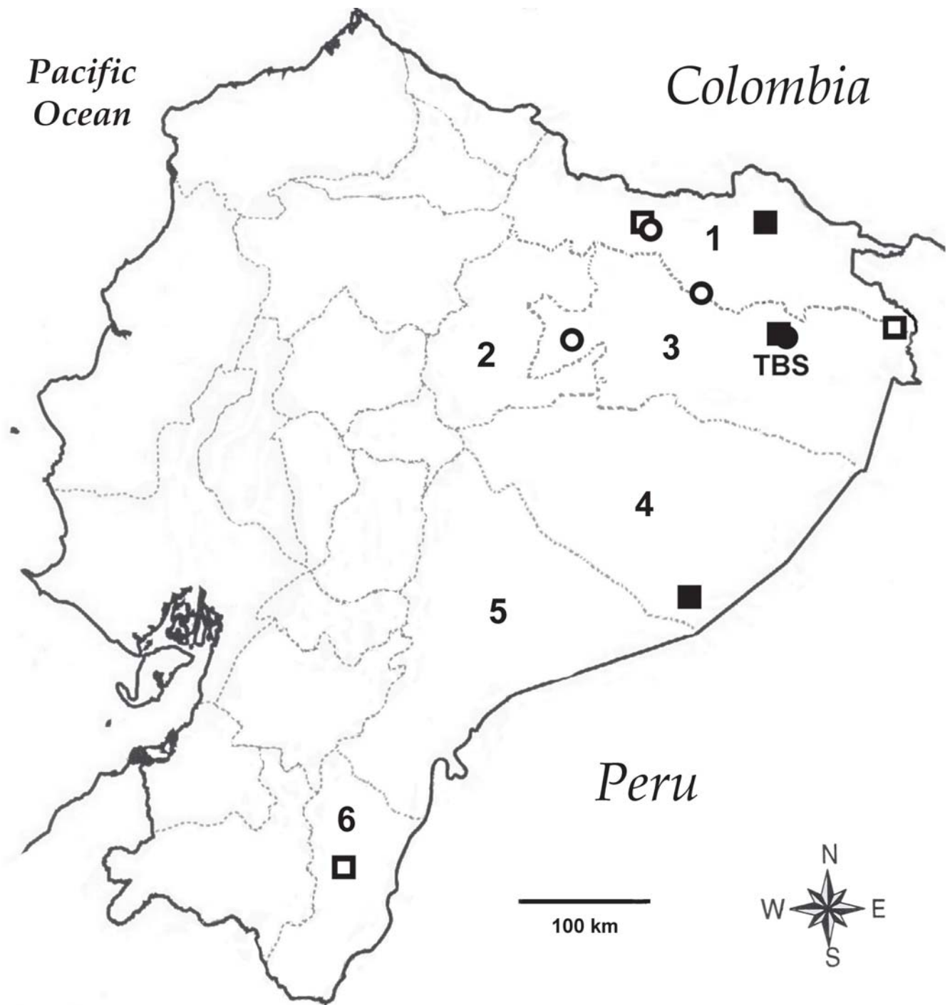
Figure 2. Known records of Chelus fimbriatus (squares) and Kinosternon scorpioides (circles) in the Republic of Ecuador. For symbols equivalence see Figure 1.