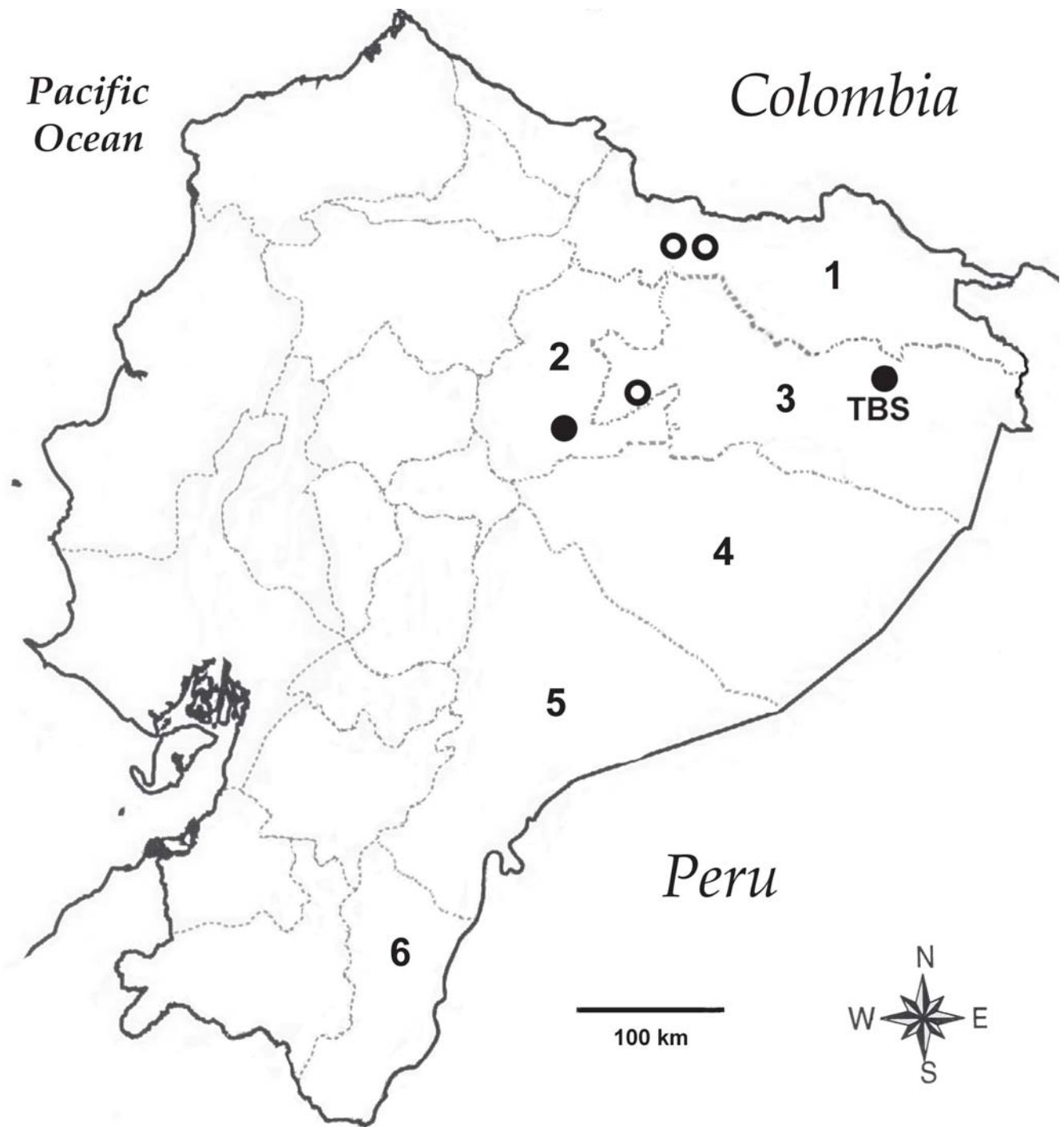
Figure 4. Known records of Phrynops geoffroanus (circles) in the Republic of Ecuador. For symbols equivalence see Figure 1.